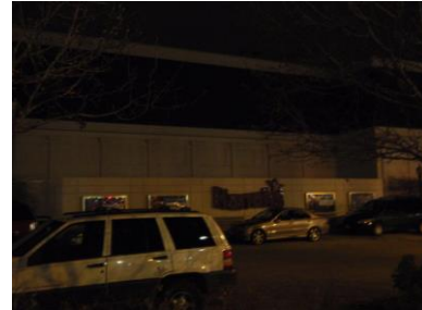
Harrah's in Joliet during Earth Hour 2011

lights. The event went global as a way for homes and businesses to raise awareness of the amount of energy we use. Earth Hour 2013 will take place on March 23, 2013 from 8:30p.m. to 9:30p.m., around the globe at each participant's local time.